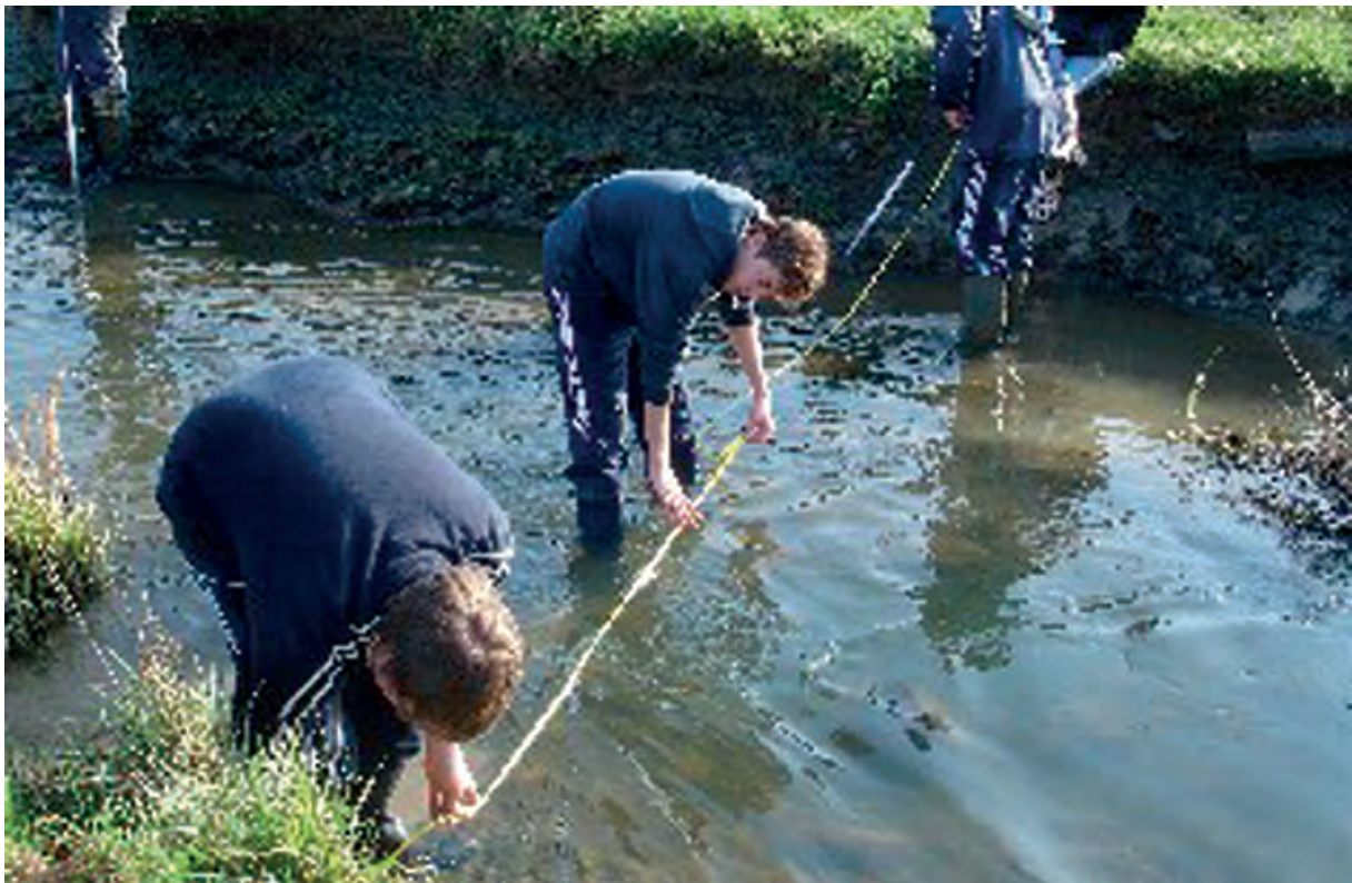
Photograph B for Question 1